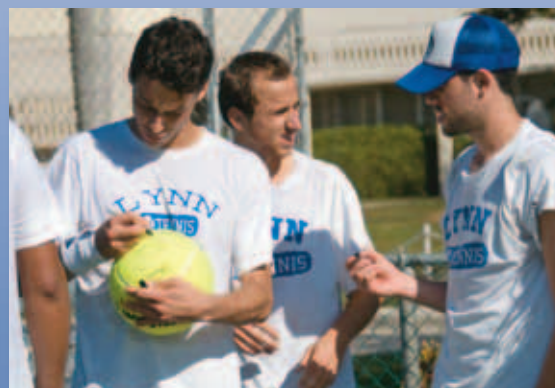
The men's team lines up to sign the tennis balls.